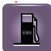
NRS EMV EZ PUMP