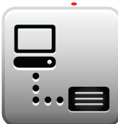
NRS FORECOURT CONTROLLER