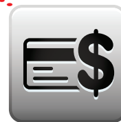
NRS PAY CC PROCESSING