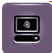
NRS PETRO DUAL-SCREEN POS