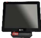
Dual Screen Monitor + Cables